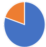
Volunteer experience on-site

■ (150) check-ins ■ (142) Check-outs ■ ■