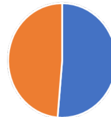
Total Check-ins/Check-outs at 8 pilot sites

■ (150) check-ins ■ (142) Check-outs ■ ■